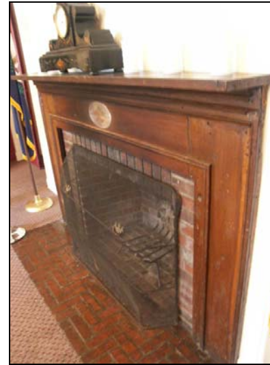
Mantel built by Thomas Lincoln, located in the Leaders Club at Ft. Knox