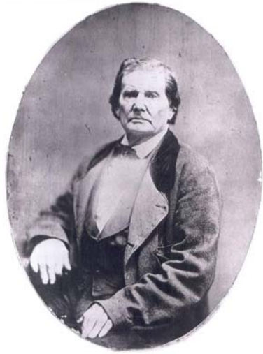
Thomas Lincoln, a Traditional Portrait

In Indiana, the Lincolns cleared the land to make a new home in the wilderness. In 1818, Nancy became ill with the “milk sickness” and died. The following year Thomas returned to Elizabethtown to marry widow Sarah Bush Johnston and brought her and her children back to Indiana. Tragedy struck the family again when Abraham’s sister died in 1828 at the age of 21. The Lincolns moved to Illinois in 1830, where Thomas and Sarah would spend the rest of their life. He passed away on January 17, 1851 and is buried with his wife in Coles County, Illinois.